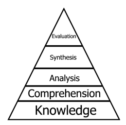
Figure 2.1 Bloom Taxonomy Pyramid

The taxonomy is often represented as a pyramid as presented in the following picture