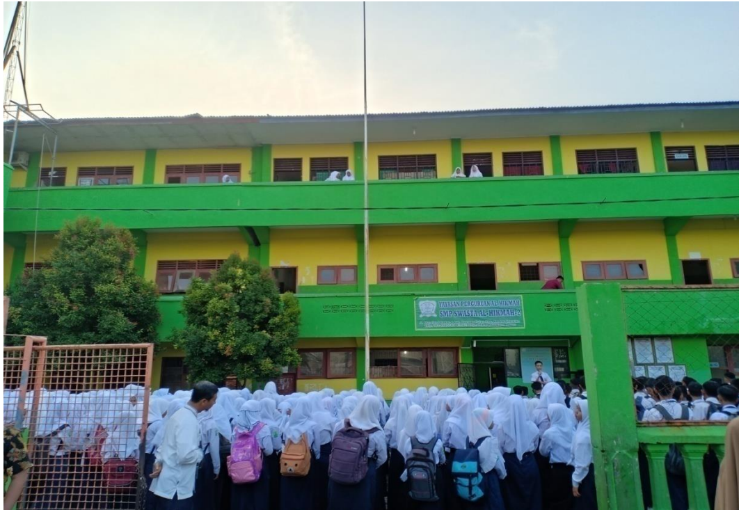
Situation of SMP Swasta AL-Hikmah Medan