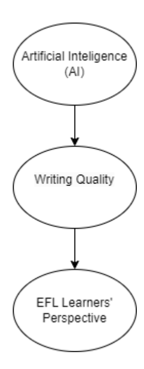
Figure 2.1 Diagram of Conceptual Framework

This conceptual framework aims to provide clear guidance in analyzing the relationships between the variables we study and in gaining a deeper understanding of the observed phenomena. The conceptual framework of this study will be designed as the following Diagram: