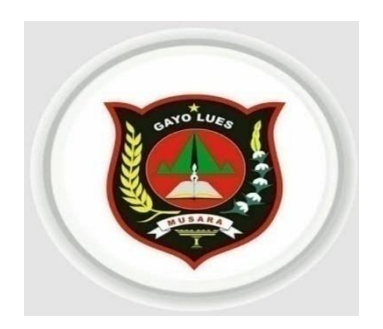
Figure 1 The Symbols of the Gayo Lues Tribe