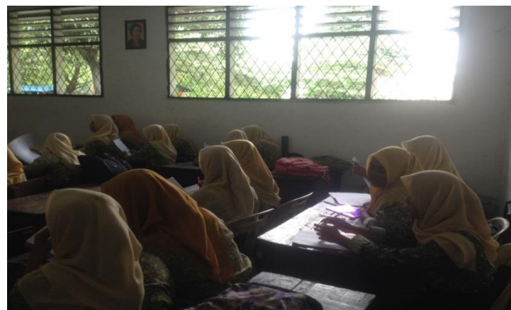
Picture 5. The students do their work