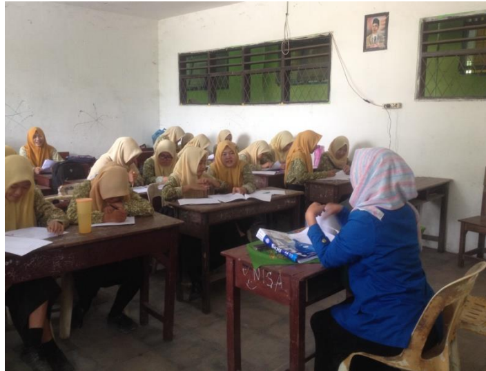
Picture 2. The researcher observed the students