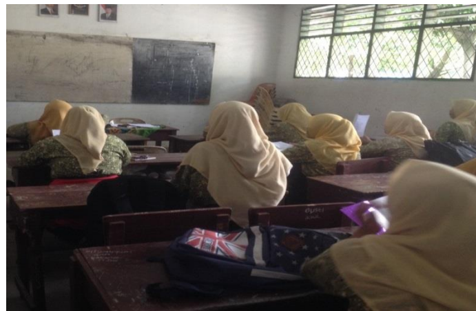
Picture 3. The students gave attention and focus to the researcher