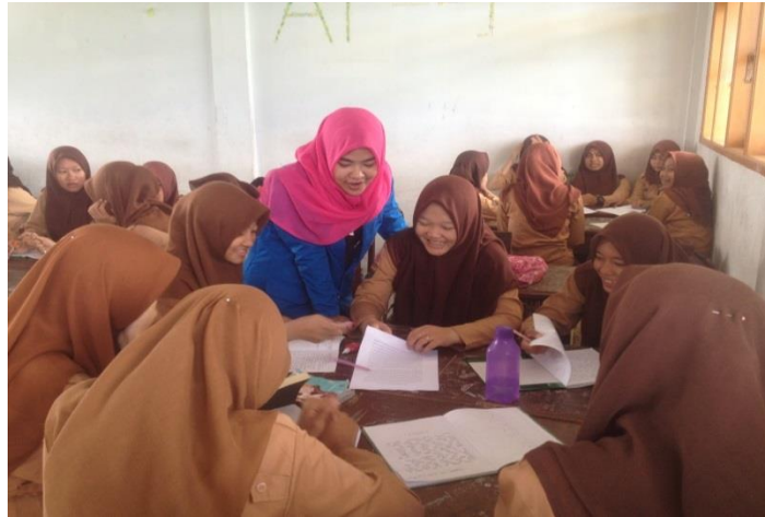
Picture 3. The researcher asked students to making a group and observed them