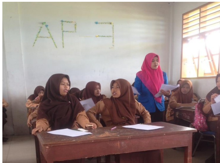
Picture 1. The researcher gave the item test for pre-test