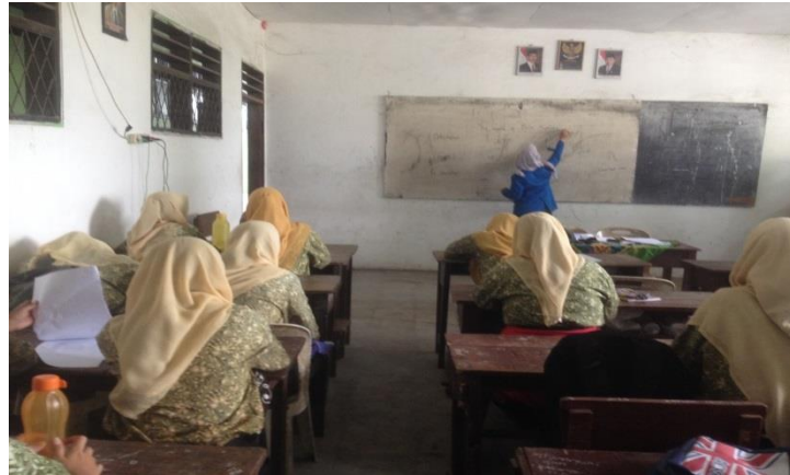
Picture 4. The researcher explained about the material