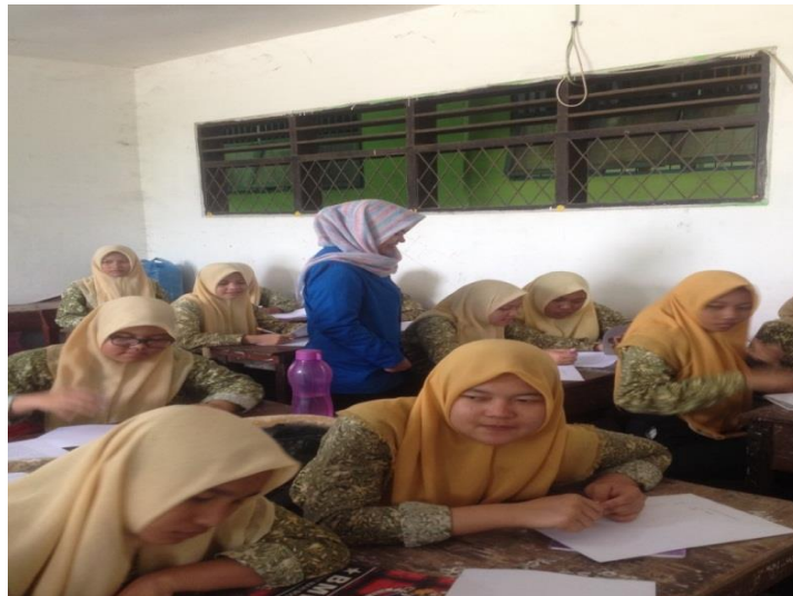
Picture 1. The researcher asked students to do the test