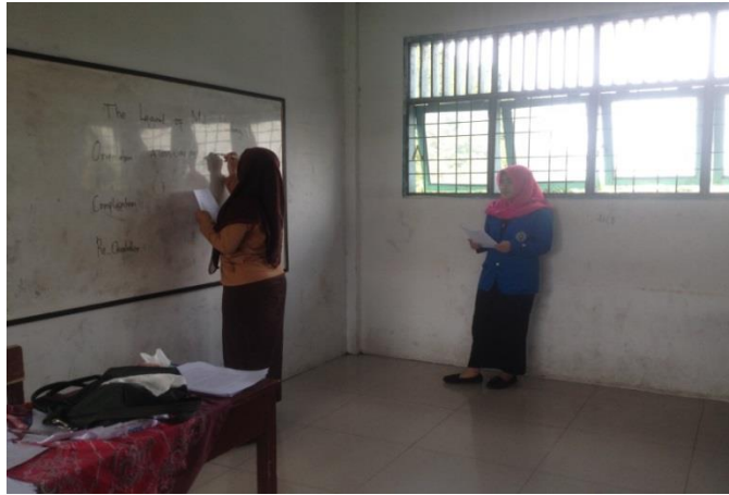
Picture 5. One of group presented their work in whiteboard.