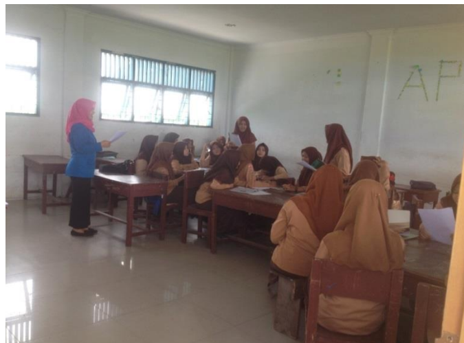
Picture 4. Each group discussed their questions and answers