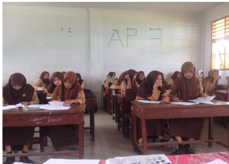
Picture 2. The students focused doing the test