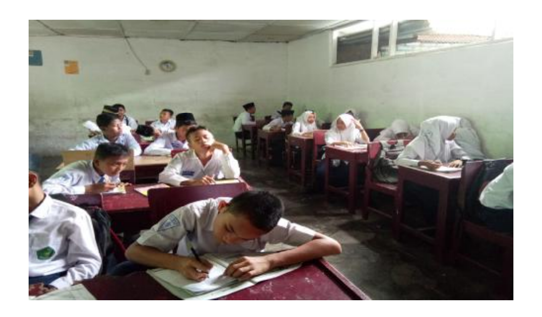
When the Researcher give Pre-Test