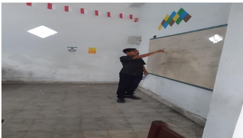
Picture 2 : The students did pre test and the teacher explained about narrative text