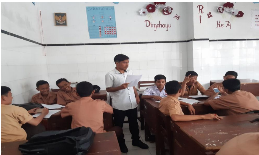
Picture 2 : The research explained the application of making predictions and inferences strategy