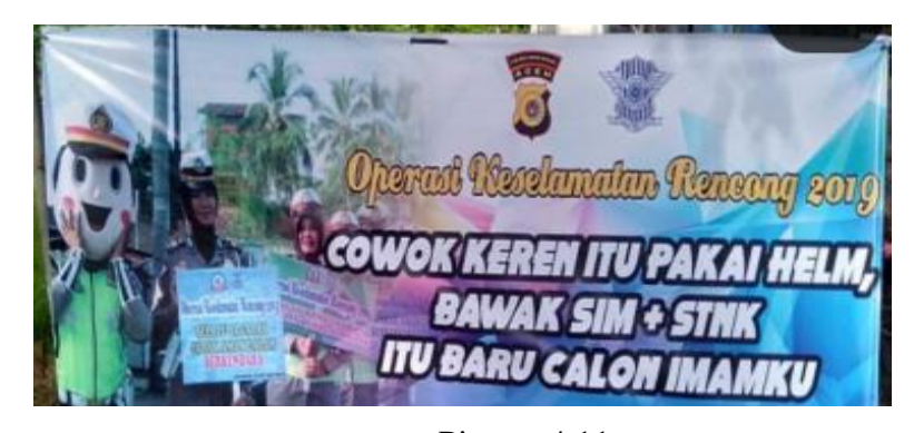
Picture 4.11 (The cool guy is wearing the helmet of the SIM + vehicle registration is my priest candidates)

There was only a few microstructure elements could be found in the banner "Dilarang ngebut penggali kubur sudah pada mudik lebaran" the banner recomended the rider to always reduce the speed when in the journey of eid homecoming to avoid the risk of accidents because the people of the tomb who were also homecoming.