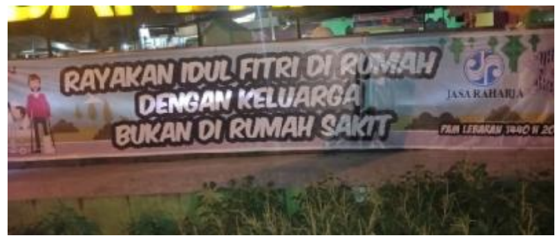
Picture 4.3 (Celebrate Eid al-fitr at home with the family instead of in hospital)

In conclusion, there was only a few microstructure elements could be found in the banner "utamakan keselamatan keluarga menanti dirumah" the banner recomended the riders to prioritize safety to reached the destination because the speed was not so decisive to met a family at home with a smile.