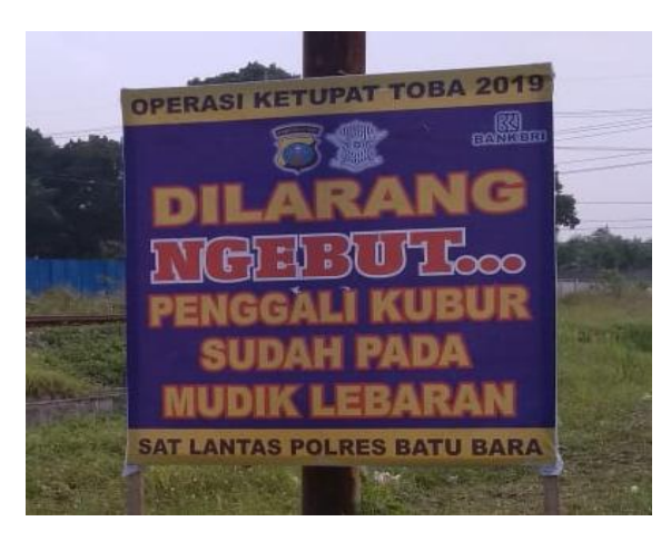
Picture 4.10 (Prohibited speeding gravediggers already on homecoming)

In the banner (4.10) the word "Dilarang ngebut... penggali kubur sudah pada mudik lebaran (prohibited speeding gravediggers already on homecoming) The form of semantic elements contained in this police banner has three parts, which were the background element, detailed element and meaning element. The background element contained in the banner was the atmosphere. Most people went to their hometowns or other places during eid al-fitr. This banner was to remind riders that gravediggers when to their hometowns just like them. This was a kind of warning that if there was an incident and a person was dead beacuse of it, then there was no one to bury them due to the absence of the gravediggers. So, those who went to their hometown during eid al-fitr should ride or drive with caution.