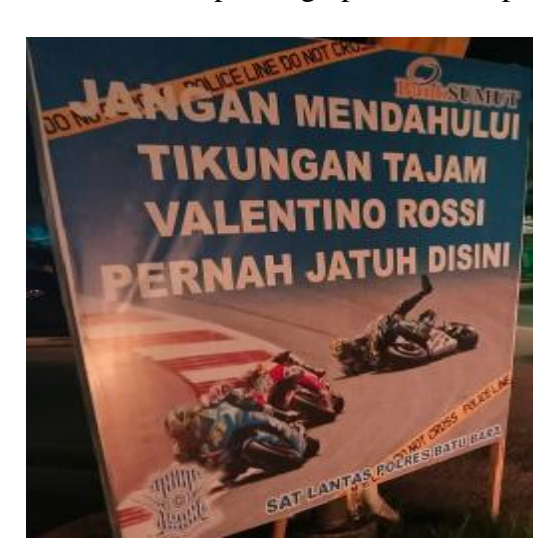
Picture 4.1 (Do not precede sharp turn valentino rossi ever fell here)

Dijk consist of (1) semantic structures that contain background, detail, and Meaning elements; (2) stylistic of microstructure that contains lexical selection elements(3) rhetorical of microstructure that contains language style elements used by banner makers such as metaphors, graphics and expressions.