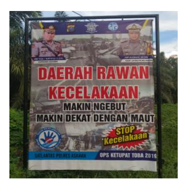
Picture 4.6 (Areas prone to accidents increasingly speeding closer to death)

were mandatory when driving a vehicle to avoid accidents because using the specifications helmet was a proof of safety awareness.