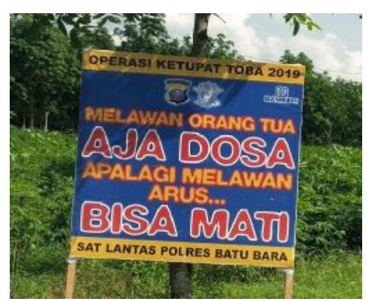
Picture 4.7 (Against parents alone sin let alone against the current can die)

Moreover, the graphic element also appeared on the banner. It provided the cognitive effect which controlled attention and interest of the readers. This effect made the readers to be fixated and focused on the banner better. This element was in the form of a picture above that's all pictures about accidents due to negligence of the motorists, then there was an appeal under the banner that "stop kecelakaan" this means that there have been many casualties caused by the accident. In conclusion, There was only a few microstructure elements could be found in the banner "Daerah Rawan kecelakaan makin ngebut makin dekat dengan maut" the banner recomended riders to reduce speed when crossing the accident-prone area because there were already many victims of traffic accidents in the area.