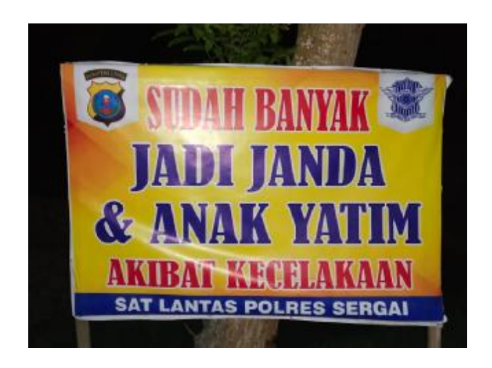
picture \ (4.12) \\ (\ Do\ Already\ many\ widows\ and\ orphans\ as\ a\ result\ of\ the\ accident\ )

In conclusion, There was only a few microstructure elements could be found in the banner "cowok keren itu pakai helem, bawak STNK +SIM itu baru calon imam ku"the banner Informed to the entire rider must wore a helmet and carry the letter of the equipment drive because the letters were the identity of our completeness on the highway. And wore a helmet can protect us when it happens accidents then with the banner was encouraged to all the riders who are good to always used the Helmet and carry letters when driving.