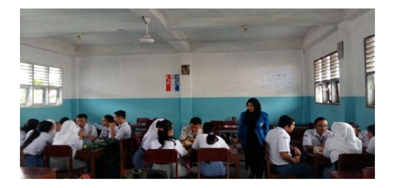
The Researcher Give Post-Test to the students