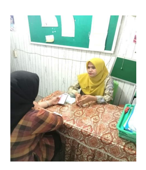
Appendix 1: Documentation