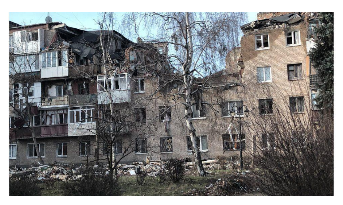
| Bombs have ripped through facades of buildings everywhere in Bakhmut

Throughout our conversation with Commander Skala, muffled explosions can be heard from above ground. The second you step outside, the sound is loud enough to make your heart pound - the terrifying whistle of shells flying in followed by the deafening boom of the impact.