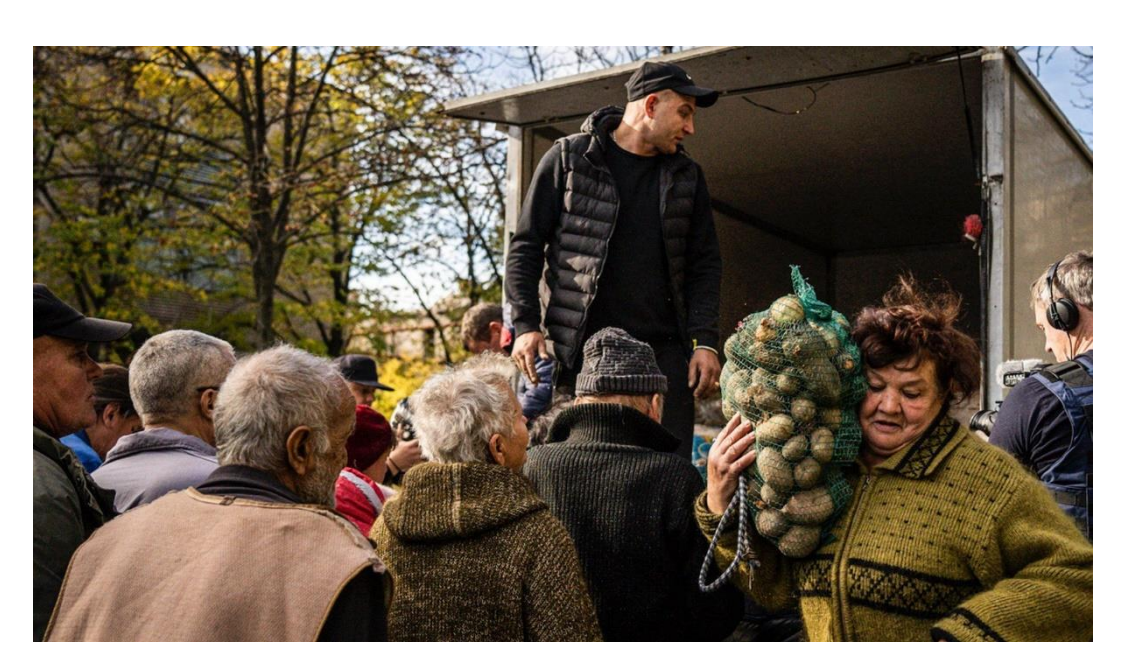
| Ukrainian volunteers distributing food

"Everyone was doing something. I admit it was very hectic in those first few days. But there were veterans helping civilians. Everyone wanted to defend their city."