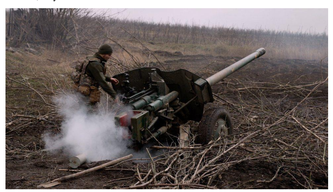
| Ukrainian forces say their weapons are outdated and they worry about running out of ammunition

Winter also makes things difficult. Weapons don't operate as smoothly in cold weather, they tell us.