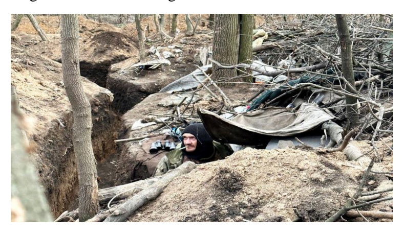
| The Ukrainians have dug a network of trenches

Another shell lands close enough to knock him off his feet. "That was a good one," he says, shaking his head and dusting himself off.