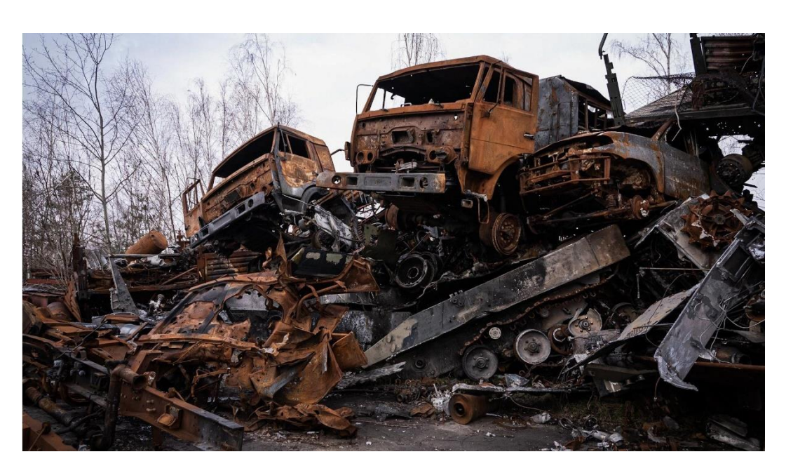
A graveyard of Russian vehicles from the convoy piled high in Hostomel

Russia is continuing to push into the eastern industrial heartland of Donbas, and strike in the south, in the direction of the Kherson and Zaporizhzhia regions.