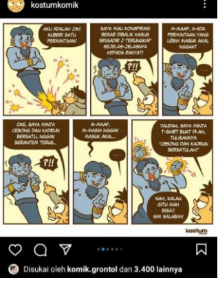
Figure 24. Screenshot from @kostumkomik

Data 17 was taken from one of the posts from the @micecartoon.co.id account uploaded on August 12, 2022.