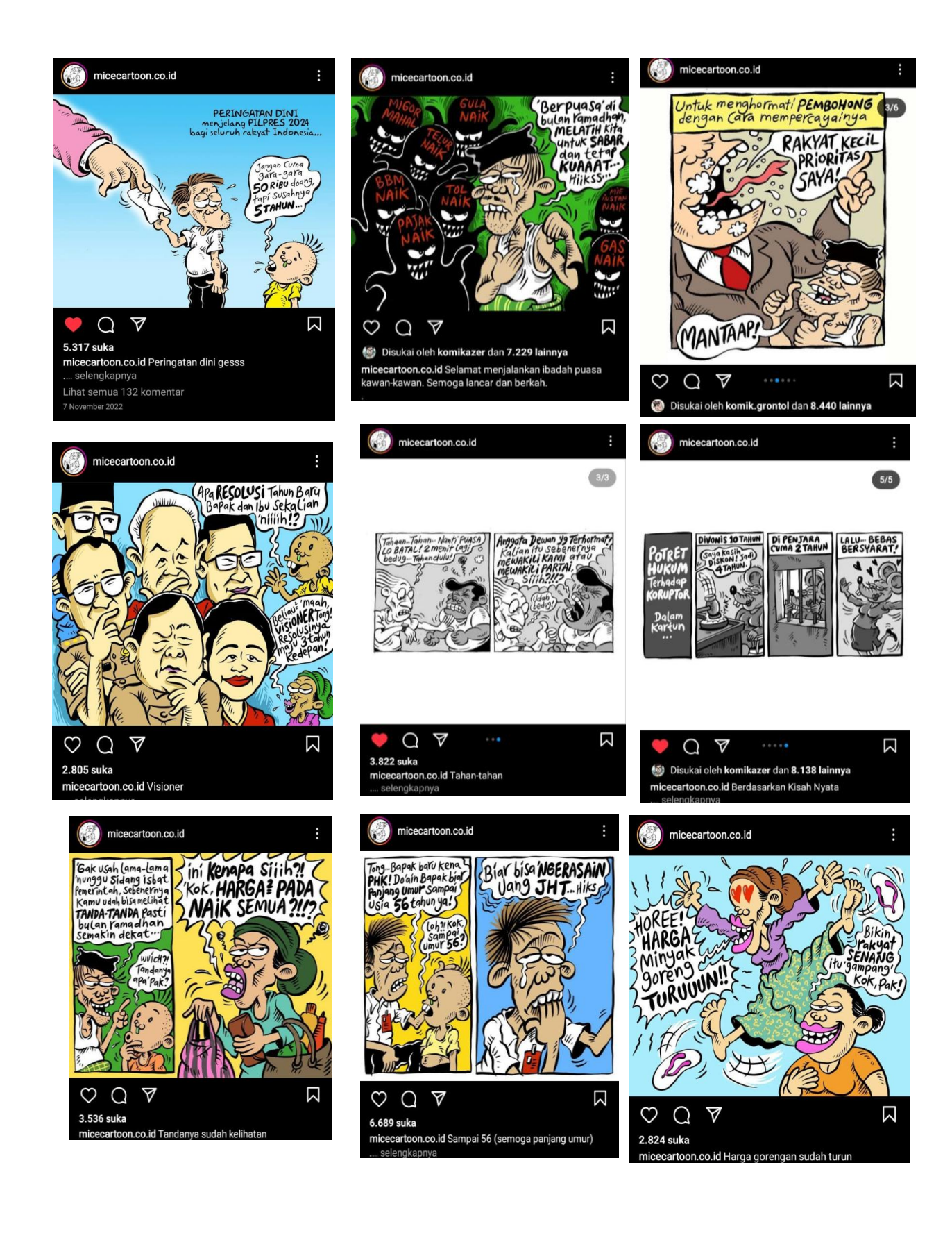
Appendix 3. Screenshot from @micecartoon.co.id Instagram Account