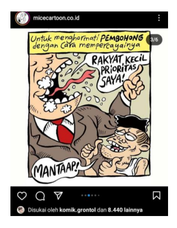
Figure 2. Example 2 from @micecartoon.co.id

An example of irony was found in one of the posts from the @micecartoon.ac.id account: