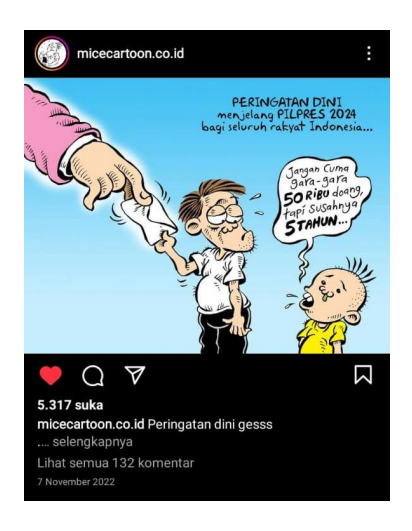
Figure 14. Screenshot from @micecartoon.co.id

Data 7 was taken from @micecartoon.co.id post uploaded on November 7, 2022