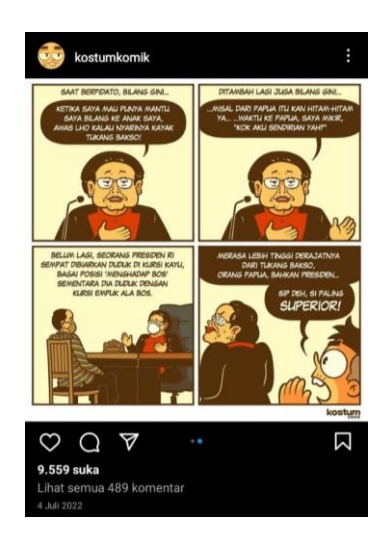
Figure 13. Screenshot from @kostumkomik

The sentence in data 6 is a sarcasm language style. This was characterized by the sentence "feeling higher than the meatball seller, the Papuan, even the president... Okay, the most SUPERIOR". The word SUPERIOR refers to the feeling of being more everything than other people. This post directly satirizes a speech delivered by one of the heads of a major political party in Indonesia. The speech delivered by her contained many controversies such as not wanting to have a son-in-law who is a meatball maker, discriminating against Papuan people who have black skin, to the president who was left sitting on a wooden chair as if he was facing the boss.