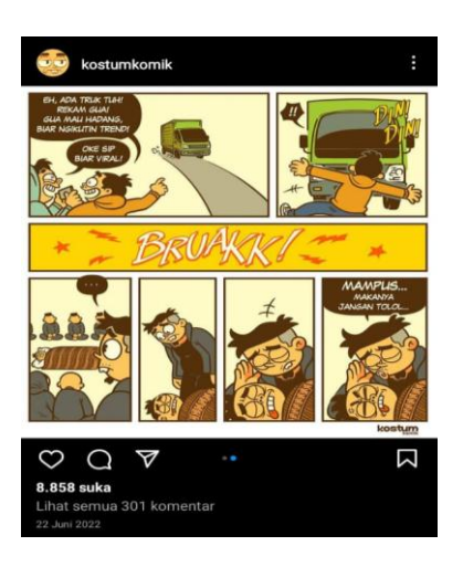
Figure 3. Example 3 from @kostumkomik

An An example of sarcasm was found in one of the posts from the @kostumkomik account uploaded on June 22, 2022.