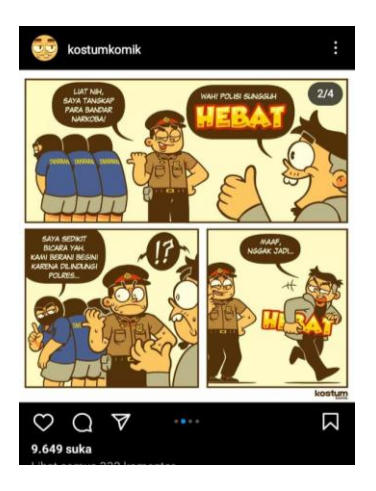
Figure 20. screenshot from @kostumkomik

Data 13 was taken from one of @kostumkomik's posts uploaded on February 22, 2023