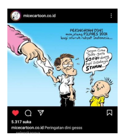
Figure 1. Example 1 from @micecartoon.co.id

There were two Instagram accounts that become research objects in this study, namely @micecartoon.ac.id and @kostumkomik. The following was an example of the type of satire language style found in the @micecartoon.ac.id Instagram account post posted on November 7, 2022.