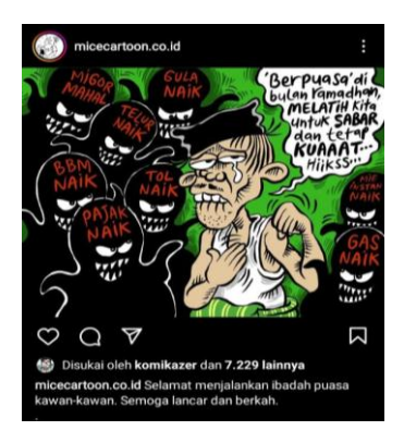
Figure 6. Example from @micecartoon.co.id

An example of Innuendo was found in one of the @micecartoon.co.id posts