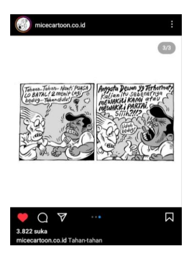
Figure 15. Screenshot from @micecartoon.co.id

Data 8 was taken from one of the posts from the account @micecartoon.ac.id which was uploaded on April 9, 20