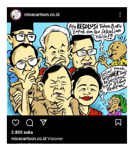
Figure 5. Example from @micecartoon.co.id

its use because it laughs at someone's situation. An example of satire was found in the @micecartoon.co.id post uploaded on January 3, 2022