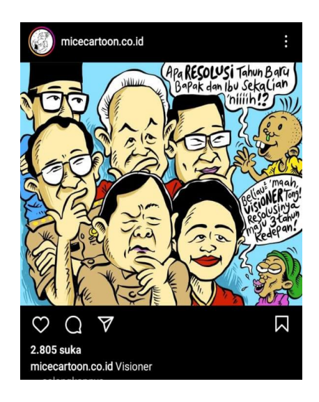
Figure 21. Screenshot from @micecartoon.co.id

Data1 4 was taken from one of the posts from the @micecartoon.co.id account uploaded on January 3, 2022.