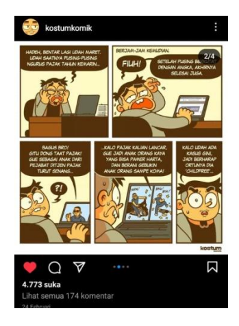
Figure 18. Screenshot from @kostumkomik

This data 11 was taken from one of the posts from the @kostumkomik account uploaded on February 24, 2023