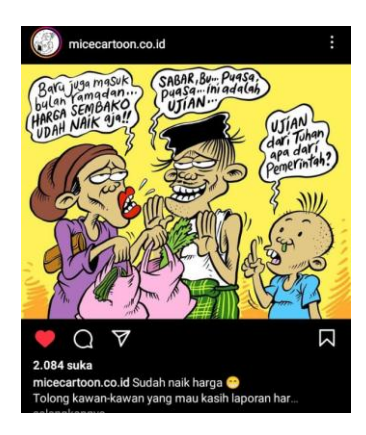
Figure 17. Screenshot from @ micecartoon.co.id

Data 10 was taken from one of the @micecartoon.co.id account posts uploaded on March 27, 2023