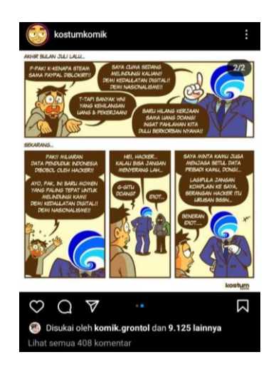
Figure 11. Screenshot from @kostumkomik

The sentence in data 4 is a sarcasm language style. This is characterized by the sentences "Idiot" and "Really Idiot". The word idiot itself is a harsh word that identifies a person's stupidity or ignorance. This is in accordance with the meaning of sarcasm, which is a crude insinuation that contains bitterness. Data 4 was sarcasm about the performance of Ministry of Communications and informatics (Kominfo), which blocked the Steam and Paypal applications on the grounds of protecting the public and for nationalism. However, when the personal data of the Indonesian people was breached by hackers, Kominfo instead asked the people to be able to protect their own personal data. Therefore, the comic artist satirized with sarcasm through the post.