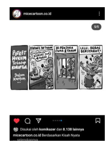
Figure 25. Screenshot from @micecartoon.co.id

Data 18 was taken from one of the posts of the @micecartoon.ac.id account uploaded on September 11, 2022