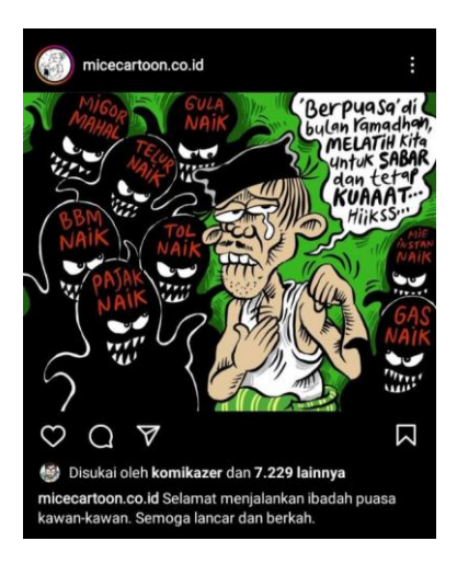
Figure 8. Screenshot from @micecartoon.co.id

This data was taken from the @micecartoon.ac.id account post uploaded on April 2, 2022