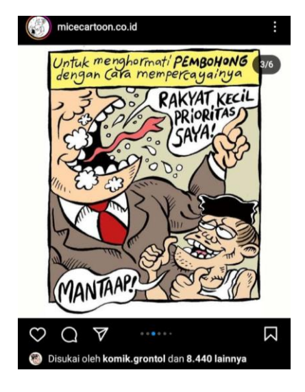
Figure 9. Screenshot from @micecartoon.co.id

Data 2 was taken from the @micecartoon.ac.id account post posted on July 29, 2022