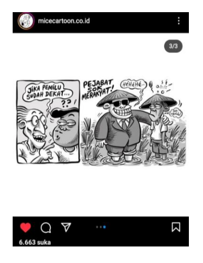
Figure 27. Screenshot from @micecartoon.co.id

Data 20 was taken from one of the @micecartoon.ac.id posts uploaded on October 2, 2022.