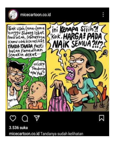
Figure 22. Screenshot from @micecartoon.co.id

Data 15 was taken from one of the posts from the @micecartoon.co.id account uploaded on March 11, 2022.