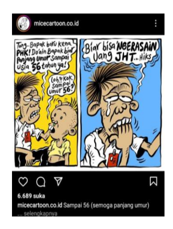
Figure 16. Screenshot from @micecartoon.co.id

Data 9 was taken from one of the account posts @micecartoon.ac.id which was uploaded on February 15, 2022