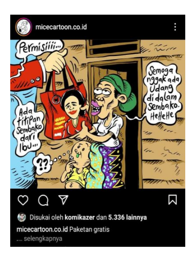
Figure 26. Screenshot from @micecartoon.co.id

Data 19 was taken from one of the posts from the @micecartoon.ac.id account uploaded on January 6, 2022.