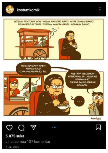
Figure 19. Screenshot from @ kostumkomik

Data 12 was taken from one of the @kostumkomik account posts uploaded on July 7, 2022.