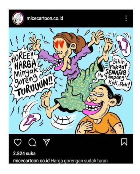
Figure 23. Screenshot from @micecartoon.co.id

Data16 was taken from one of the posts from the @micecartoon.co.id account uploaded on January 21, 2022