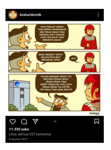
Figure 12. Screenshot from @kostumkomik

The sentence in data 5 is a sarcasm language style. This is characterized by the sentence "Please dismantle that place! Prove whether the people who work there, are people who understand the technology, or just old people who are clueless of technology but are paid using public money?" The sentence "just old people who are clueless of technology but are paid using public money" was a crude insinuation aimed at people who work at Kominfo. The word "clueless of technology" represents someone who does not understand technology. People who work at Kominfo should understand technology. This is because the personal data of Indonesian people can be easily stolen by hackers. Kominfo should protect these data. But in reality, a lot of people's personal data is stolen by hackers.