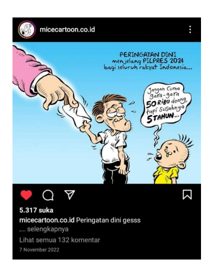
Figure 4. Example from @micecartoon.co.id

Cynicism is a satire that contains ridicule of sincerity. Waridah (2016:372) states that cynicism is satire in the form of testimony to a narrative or contains mockery of sincerity. While Keraf (2008:143) states cynicism is the name of a school of Greek philosophy that first taught that virtue is the only good, and its essence lies in self-control and freedom. Subsequently, they became harsh critics of social mores and other philosophies.