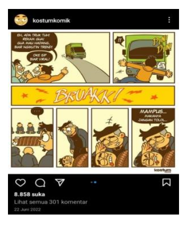
Figure 10. Screenshot from @kostumkomik

This data was taken from @kostumkomik post uploaded on June 22, 2022