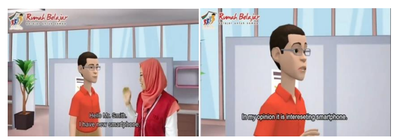
Figure 4.3.5 Asking and Giving Opinion (Friendly/Communicative)