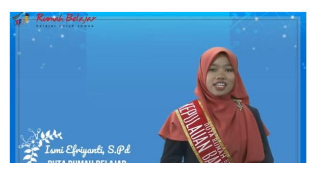
Figure 4.2.1. Narrative text (Religius)

Religious character values reflect faith in God the Almighty which is manifested in the behavior of carrying out the teachings religion and beliefs, respecting religious differences, uphold a tolerant attitude towards the implementation of religious worship and other beliefs, live in harmony and peace with followers of other religions.