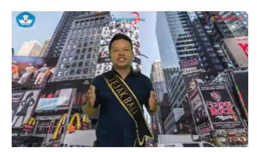
Figure 4.5.1. Event Advertisement ( Honesty)

Honesty. Being honest it means being truthful. In other words, honest means say something that according to the facts there is no over statement or reduction in these words. So theory is associated with data because the data shows the behavior of someone who can be trusted from the words and action. This theory prioritizes data.