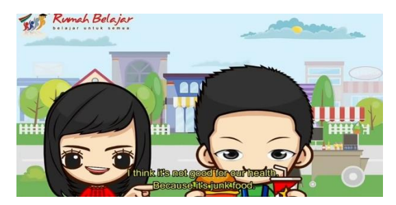
Figure 4.3.2 Asking & Giving Opinion (Honesty)

Honesty is honest means say something that according to the facts there is no over statement or reduction in these words. In other word Honesty is human behavior that is based on an effort to make himself a capable person trusted in deeds, actions, and work. So theory is associated with data because the data shows the behavior of someone who can be trusted from the words and action. This theory prioritizes data.