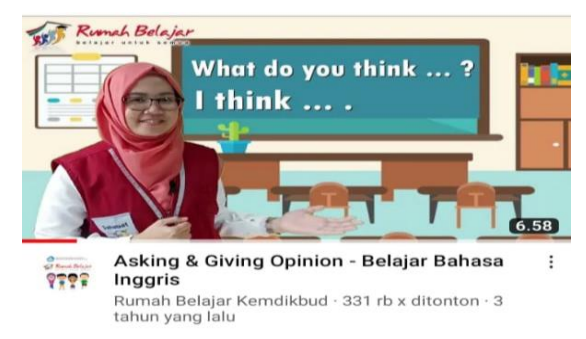
Figure 4.3.7 Asking & Giving Opinion (Creative)

Creative. Being creativeit means that creative people can create something based on ideas that arise from themselves that can be developed and useful for us and others. The theory matched with the following data.