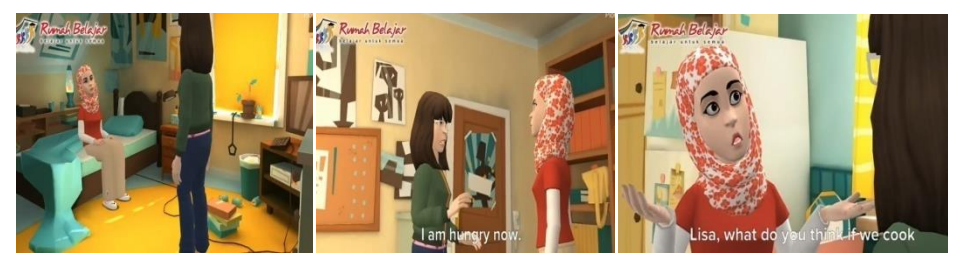
Figure 4.3.6. Asking & Giving Opinion (Social Care)