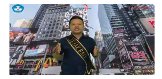
Figure 4.5.4. Event Advertisement (Craetive)

Creative. Being creativeit means that creative people can create something based on ideas that arise from themselves that can be developed and useful for us and others. The theory matched with the following data.