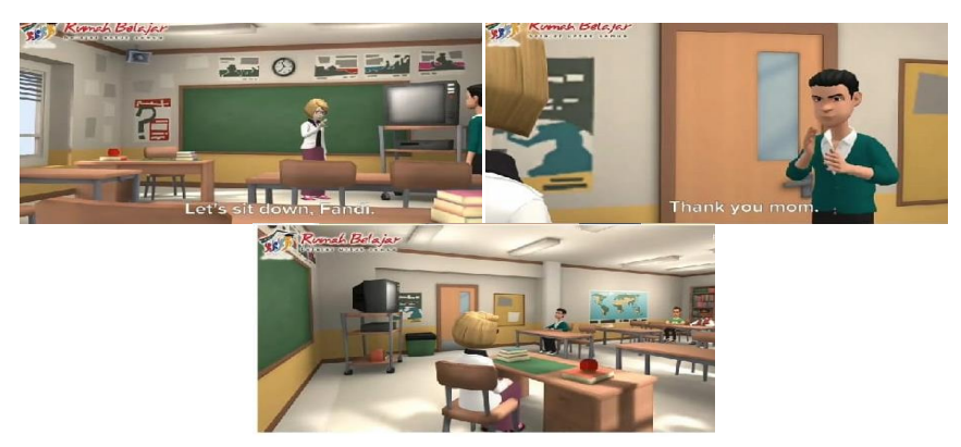
Figure 4.3.3. Asking & Giving Opinion (Discipline)

Discipline. Being discipline is the attitude or feeling obedient in obeying the rules and values that are believed to be his responsibility. The theory was applicable with data below.