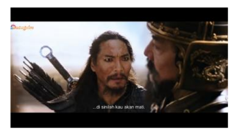
Bori Khan : this is where you will die. What should I say? Burn? Who will come to save you son of heaven? Where is the son of the emperor.