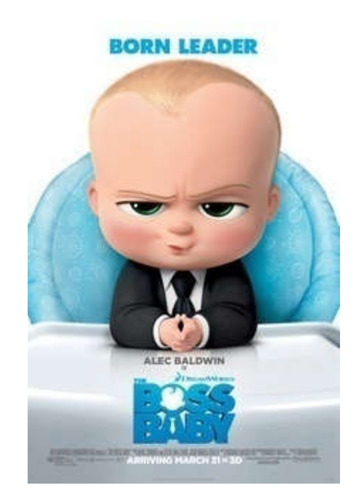
Figure 2.1 : The Thetrical release poster

DreamWorks Animation and the director of Madagascar invite you to meet a most unusual baby. He wears a suit, speaks with the voice and wit of Alec Baldwin, and stars in the animated comedy, DreamWorks' The Boss Baby. The Boss Baby is a hilariously universal story about how a new baby's arrival impacts a family, told from the point of view of a delightfully unreliable narrator, a wildly imaginative 7 year old named Tim. With a sly, heart-filled message about the importance of family, DreamWorks' The Boss Baby is an authentic and broadly appealing original comedy for all ages.