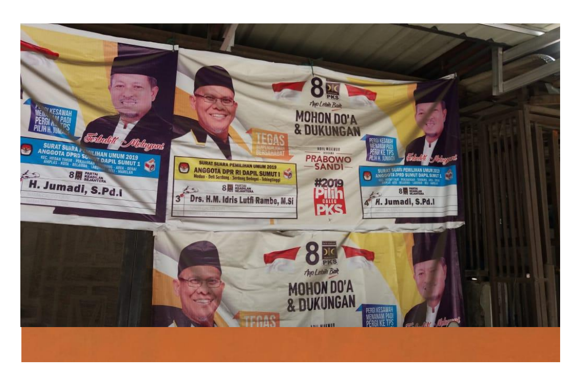
Figure. 11 & 12