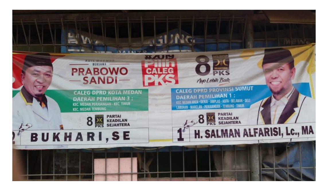
Figure. 4 & 5