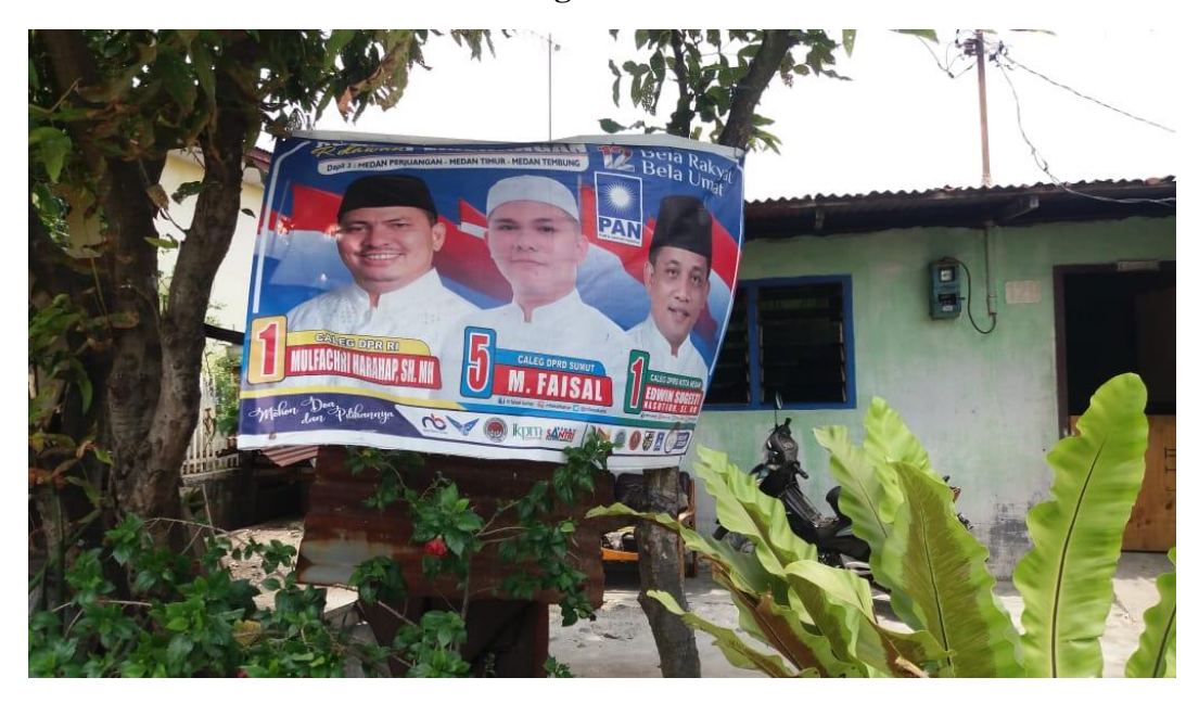
Figure. 14 & 15