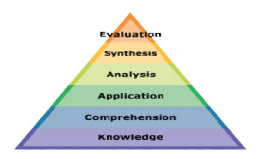
Figure 2.1 Original Version of Bloom's Taxonomy