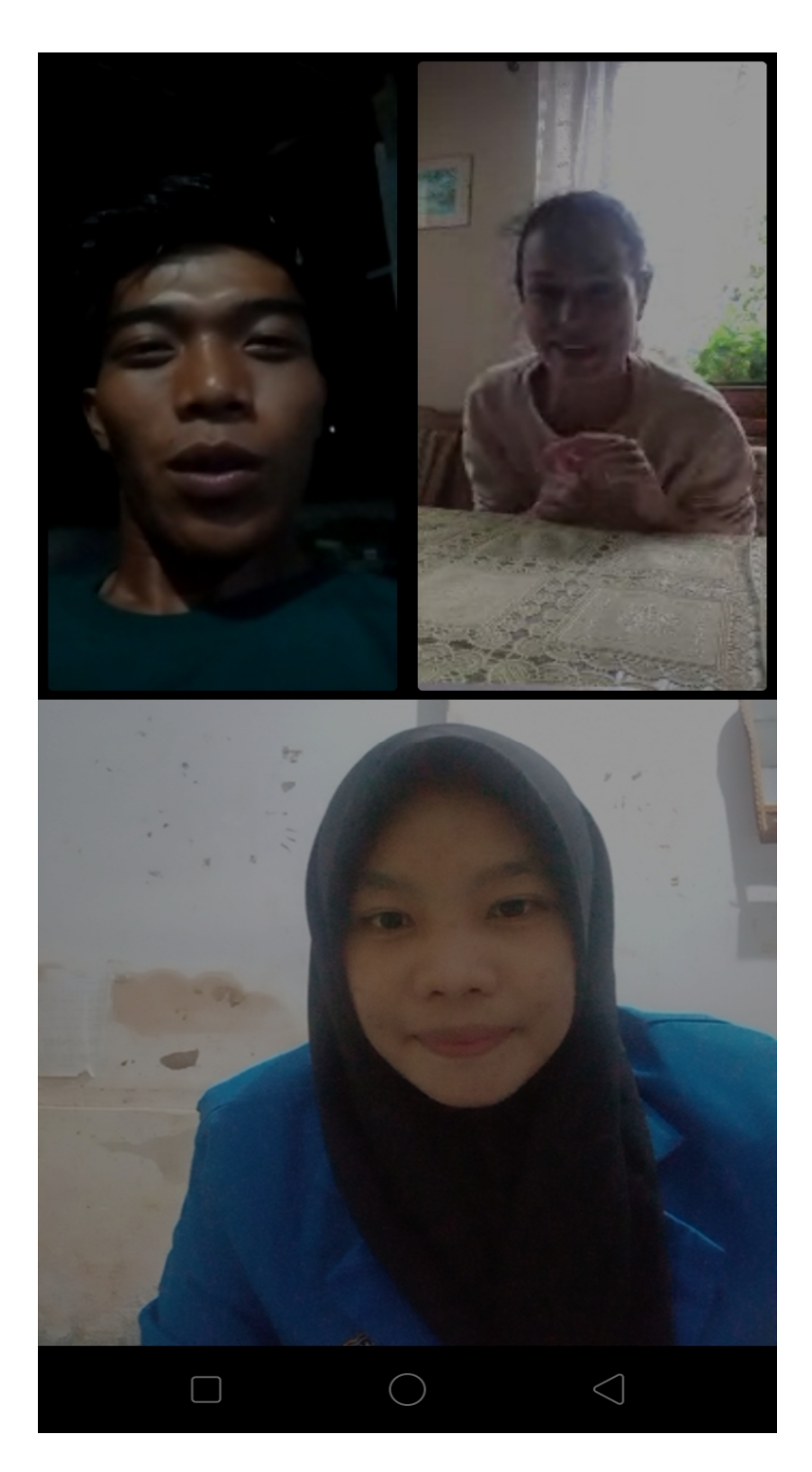
P2. We were interviewed with second tour guide and foreign tourist