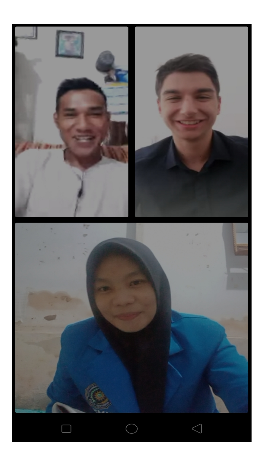
P1. We were interviewed with first tour guide and foreign tourist