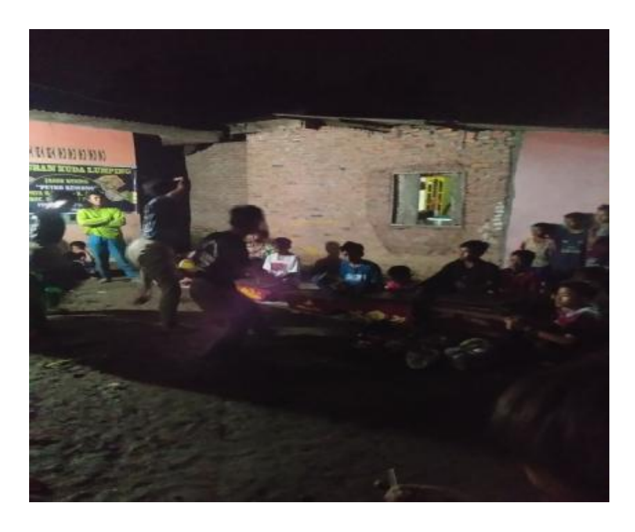
3. The jathilan players dancing with accompanied by javanese music