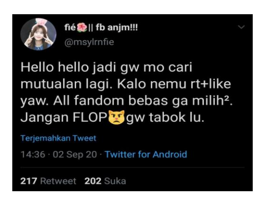
Figure 4.6 Screenshot Twit of fie || fb or @msylrnfie

On the Twitter account with the name of fie || fb or @msylrnfie which was uploaded on 02 September 2020 at 14:36 via android.