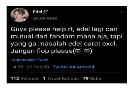
Figure 4.5 Screenshot Twit of Edel or @Edeleeee

On the Twitter account with the name of Edel or @Edeleeee which was uploaded on 02 September 2020 at 14:29 via android.