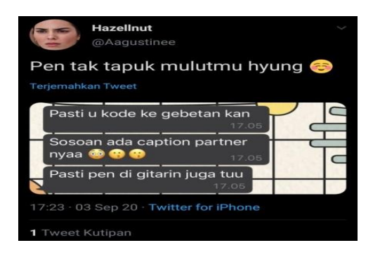
Figure 4.11 Screenshot Twit of Hazellnut or @Aagustinee

On the Twitter account with the name of Hazellnut or @Aagustinee which was uploaded on 03 September 2020 at 17:23 via android.