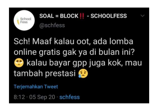
Figure 4.16 Screenshot Twit of SOAL = BLOCK !! - SCHOOLFESS

On the Twitter account with the name of SOAL = BLOCK !! - SCHOOLFESS or @schfess which was uploaded on 05 September 2020 at 08:12 via android.