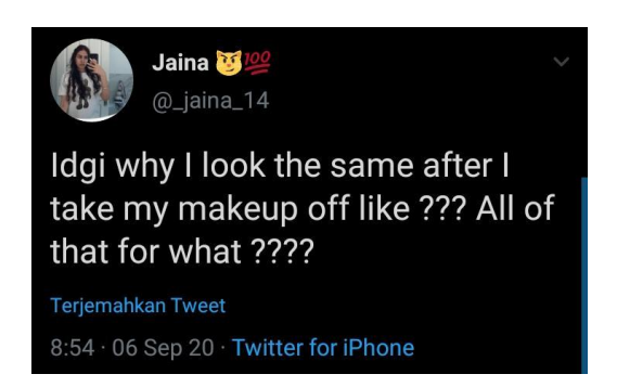
Figure 4.19 Screenshot Twit of Jaina or @_jaina_14

On the Twitter account with the name of Jaina or @_jaina_14 which was uploaded on 06 September 2020 at 08:54 via android.