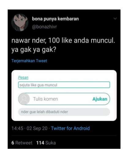
Figure 4.7 Screenshot Twit of bona punya kembaran or @bonazhivr

On the Twitter account with the name of bona punya kembaran or @bonazhivr which was uploaded on 02 September 2020 at 14:45 via android.