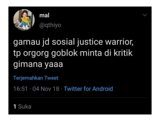
Figure 4.1 Screenshot Twit of Mal or @qthiyo

On the Twitter account with the name of mal or @qthiyo which was uploaded on 04 November 2018 at 16:51 via android.