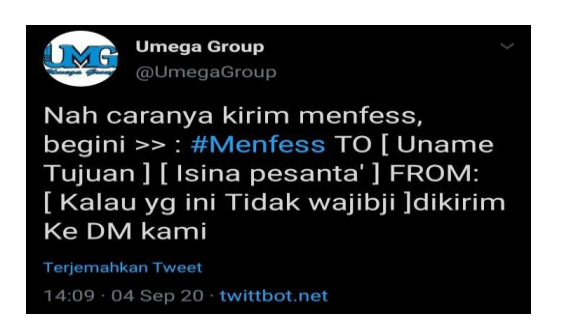
Figure 4.12 Screenshot Twit of Umega Group or @UmegaGroup

On the Twitter account with the name of Umega Group or @UmegaGroup which was uploaded on 04 September 2020 at 14:09 via twittbot.