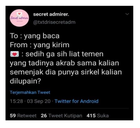
Figure 4.10 Screenshot Twit of secret admirer or @txtdrisecretadm