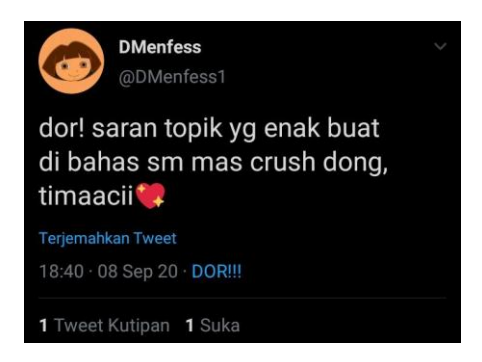
Figure 4.24 Screenshot Twit of DMenfess or @DMenfess1