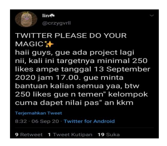
Figure 4.28 Screenshot Twit of lin or @crzygvril

On the Twitter account with the name of lin or @crzygvril which was uploaded on 06 September 2020 at 08:32 via android.