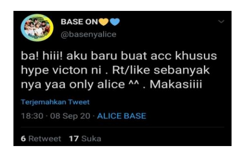
Figure 4.23 Screenshot Twit of BASE ON♥♥ or @basenyalice

On the Twitter account with the name of BASE ON♥♥ or @basenyalice which was uploaded on 08 September 2020 at 18:30 via android.