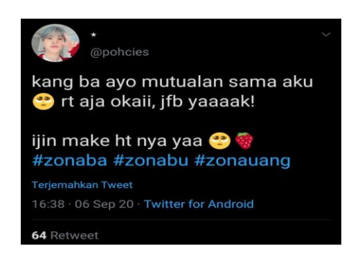
Figure 4.21 Screenshot Twit of * or @pohcies

On the Twitter account with the name of * or @pohcies which was uploaded on 06 September 2020 at 16:38 via android.