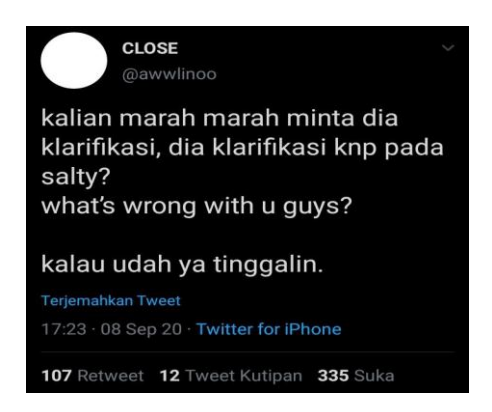
Figure 4.29 Screenshot Twit of CLOSE or @awwlinoo