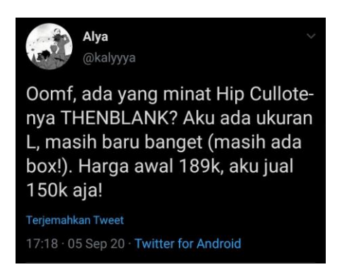
Figure 4.17 Screenshot Twit of Alya or @kalyyya

On the Twitter account with the name of Alya or @kalyyya which was uploaded on 05 September 2020 at 17:18 via android.