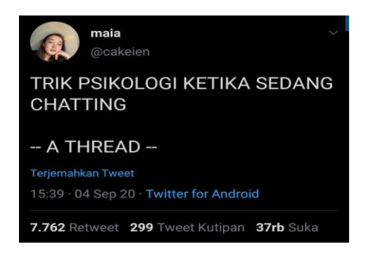
Figure 4.13 Screenshot Twit of maia or @cakeien

On the Twitter account with the name of maia or @cakeien which was uploaded on 04 September 2020 at 15:39 via android.