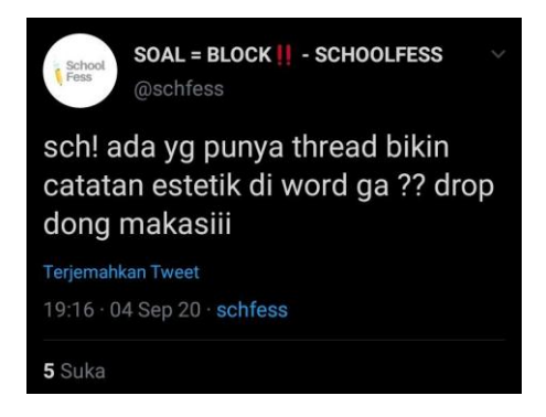
Figure 4.15 Screenshot Twit of SOAL = BLOCK !! - SCHOOLFESS