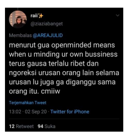
Figure 4.4 Screenshot Twit of raii or @ziaziabanget

On the Twitter account with the name of raii or @ziaziabanget which was uploaded on 02 September 2020 at 13:02 via android.