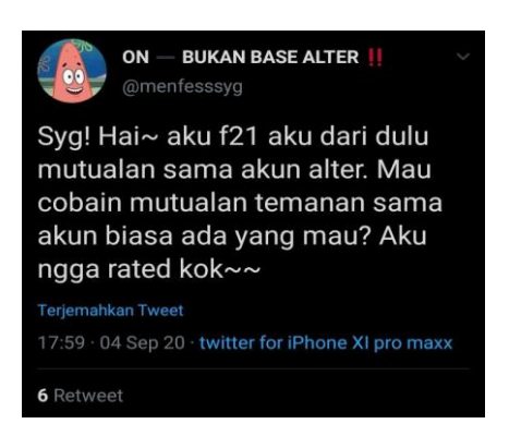
Figure 4.14 Screenshot Twit of ON – BUKAN BASE ALTER !! or @menfesssyg

On the Twitter account with the name of ON – BUKAN BASE ALTER !! or @menfesssyg which was uploaded on 04 September 2020 at 11:22 via iphone XI pro maxx.