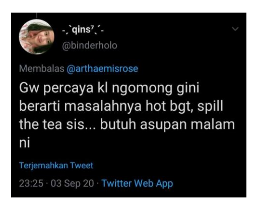
Figure 4.27 Screenshot Twit of qins<sup>7</sup> or @binderholo