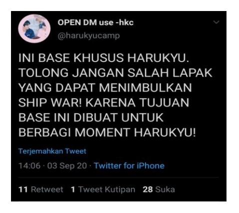
Figure 4.9 Screenshot Twit of OPEN DM use -hkc or @harukyucamp

On the Twitter account with the name of OPEN DM use -hkc or @harukyucamp which was uploaded on 03 September 2020 at 14:06 via android.