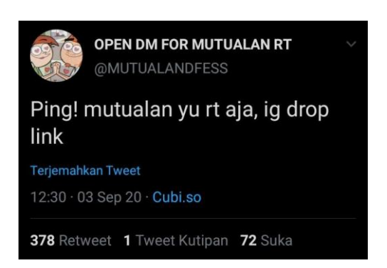
Figure 4.8 Screenshot Twit of OPEN DM FOR MUTUALAN RT or @MUTUALANDFESS

On the Twitter account with the name of OPEN DM FOR MUTUALAN RT or @MUTUALANDFESS which was uploaded on 03 September 2020 at 12:30 via cubi.so.