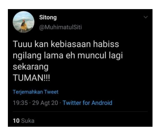
Figure 4.2 Screenshot Twit of Sitong or @MuhimatulSiti

On the Twitter account with the name of Sitong or @MuhimatulSiti which was uploaded on 29 Agustus 2020 at 19:35 via android.