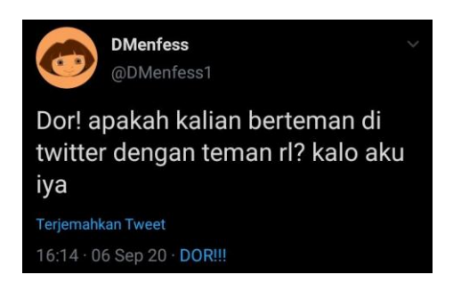
Figure 4.20 Screenshot Twit of DMenfess or @DMenfess1

On the Twitter account with the name of DMenfess or @DMenfess1 which was uploaded on 06 September 2020 at 16:14 via android.