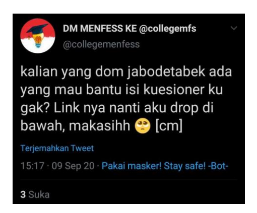
Figure 4.26 Screenshot Twit of DM MENFESS KE @collegemfs or @collegemenfess

On the Twitter account with the name of DM MENFESS KE @collegemfs or @collegemenfess which was uploaded on 09 September 2020 at 15:17 via pakai masker! Stay safe! –Bot-.