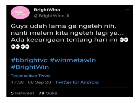
Figure 4.30 Screenshot Twit of BrightWins or @BrightWins