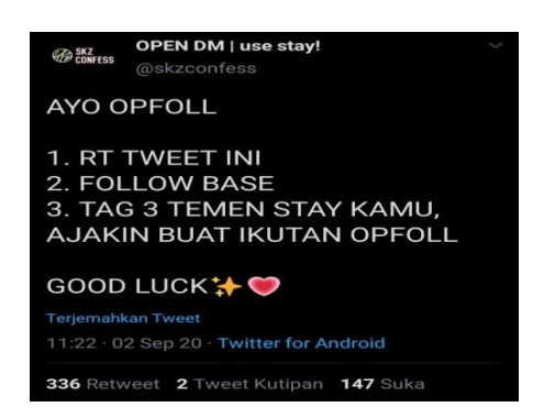
Figure 4.3 Screenshot Twit of OPEN DM | use stay! or @skzconfess